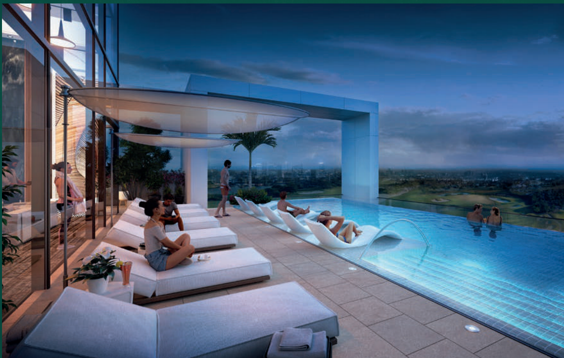
Infinity Edge Pool